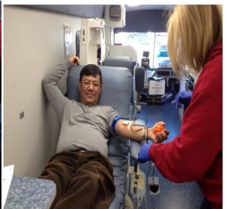
Blood Drive in Huntsville, AL